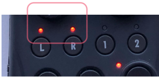
red lights indicate active